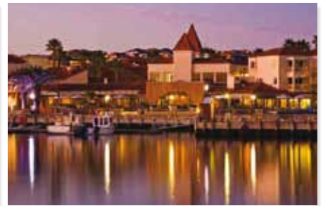
1/9 th page - 58mm(w) x 81mm(h)

Joondalup Resort offers you the perfect venue to work, rest and play.