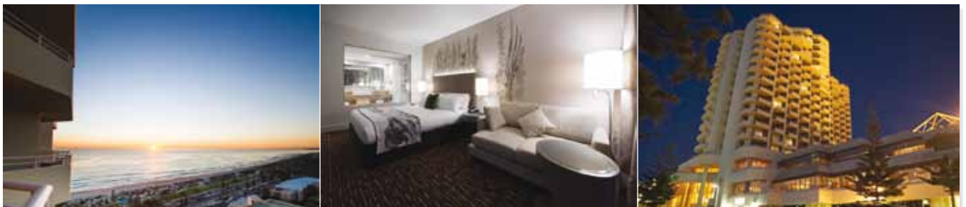
1/3 rd page - 178mm (w) x 81mm (h)